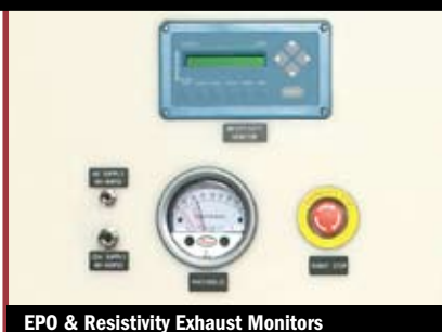
EPO & Resistivity Exhaust Monitors