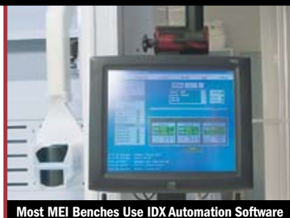
Most MEI Benches Use IDX Automation Software