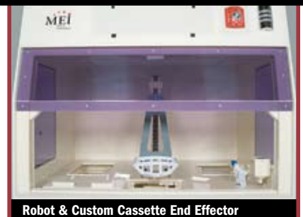
Robot & Custom Cassette End Effector