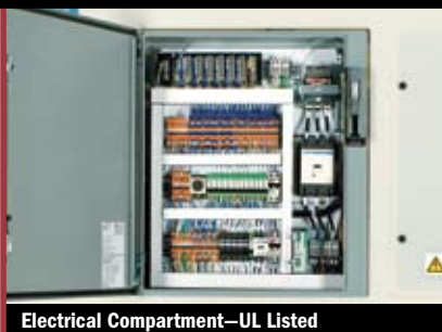
Electrical Compartment—UL Listed