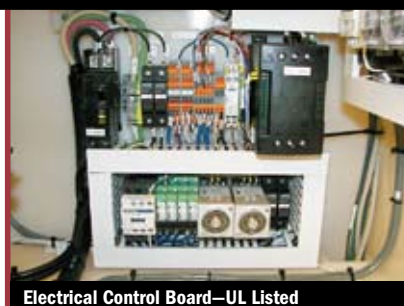
Electrical Control Board—UL Listed